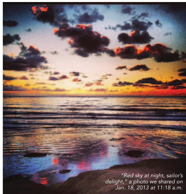
"Red sky at night, sailor's delight," a photo we shared on Jan. 18, 2013 at 11:18 a.m.

CONNECT Want to learn more about these mysterious creatures? Join us for Shark Sundays at our Santa Monica Pier Aquarium, healthebay.org/smpa