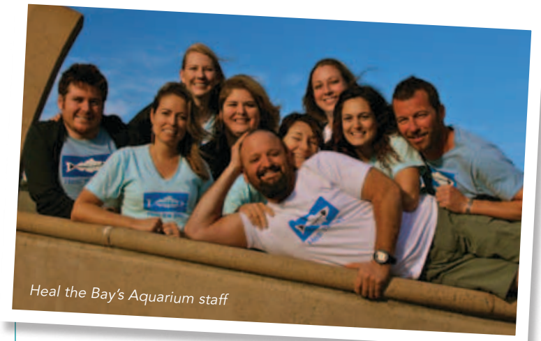
Heal the Bay's Aquarium staff