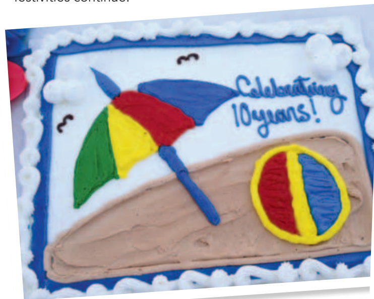
More than 650 well-wishers joined us for cake and ice cream over the March 1st weekend.