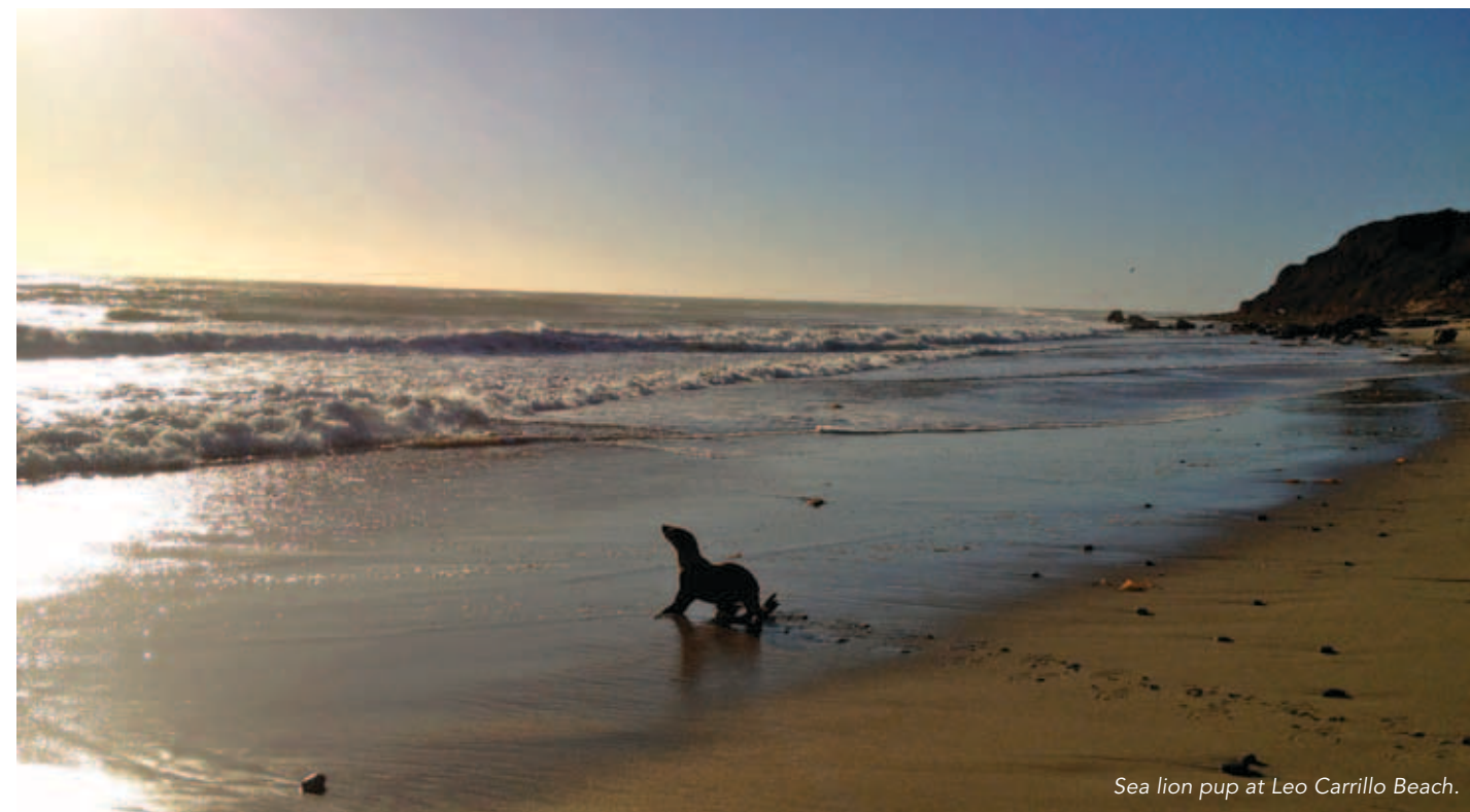
Sea lion pup at Leo Carrillo Beach.

Burritos at Romero's Rotisserie Chicken on Colorado Ave., right at Ocean by the Santa Monica Pier.