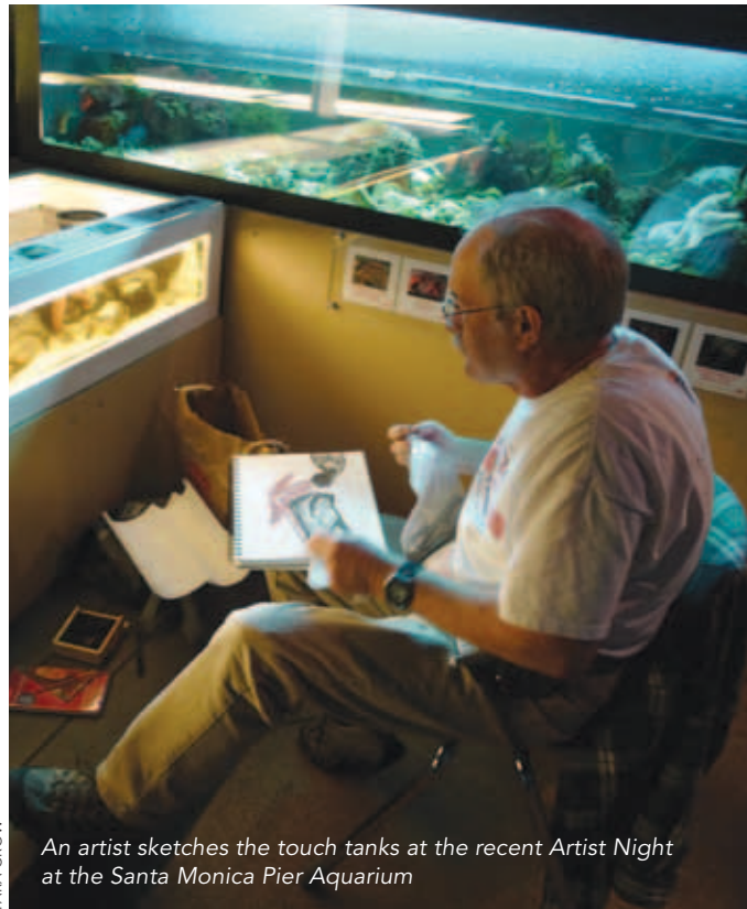
An artist sketches the touch tanks at the recent Artist Night at the Santa Monica Pier Aquarium

The Santa Monica Pier Aquarium has a lot of drawing power ... literally.