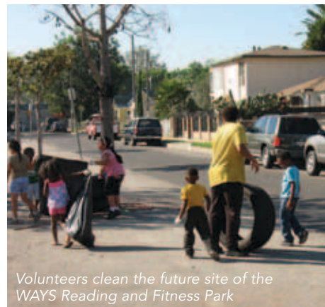
Volunteers clean the future site of the WAYS Reading and Fitness Park

In 2011, Heal the Bay will launch our Beyond Local Workshops, which will train individuals to take action in their local communities to improve the environment. The eight-week training session will draw from Heal the Bay's varied outreach programs, like Speakers Bureau and Beach Captain trainings, to provide workshop participants with a more hands-on experience and enable them to become Heal the Bay leaders.