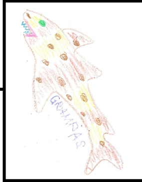
My Maternal Grandfather